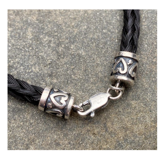
Heart ends (thin braids only)