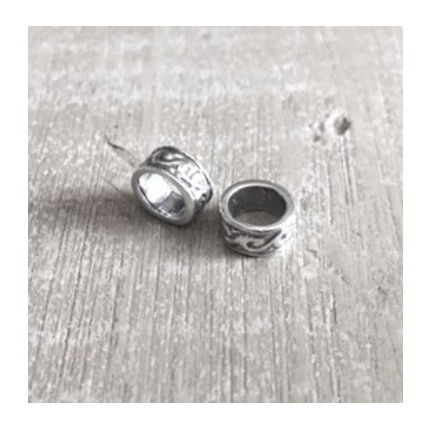
PATTERNED SKINNY BEAD R75 each