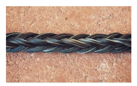
SQUARE BRAID (8 sections)

Simple, beautiful and tough. Perfect for occasional to medium wear.