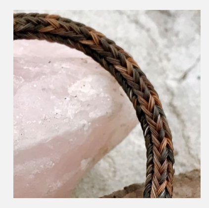
CHEVRON ROUND BRAID (16 sections)