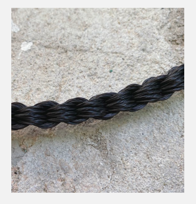
CHAIN BRAID (16 sections)