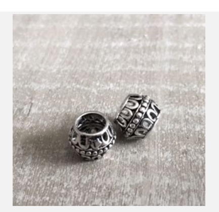
FILIGREE BEAD R90 ea.