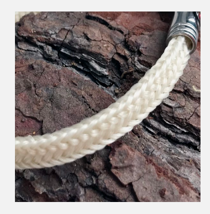
FLAT BRAID (16 sections)