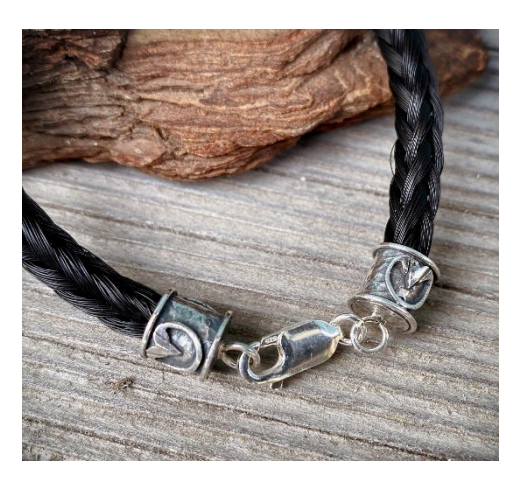
Hoof print ends (medium width)