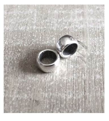
PLAIN ROUNDED BEAD R75 each

Pairs perfectly with the square end caps!