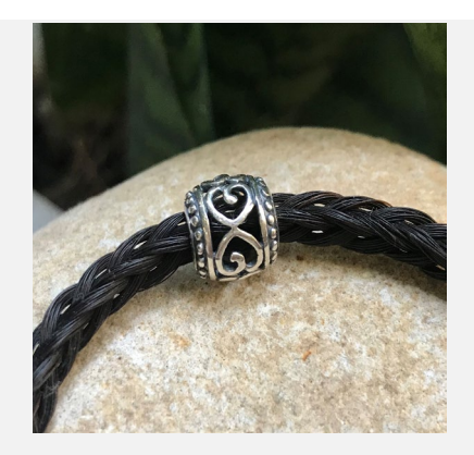
HEART BEAD R130 ea.