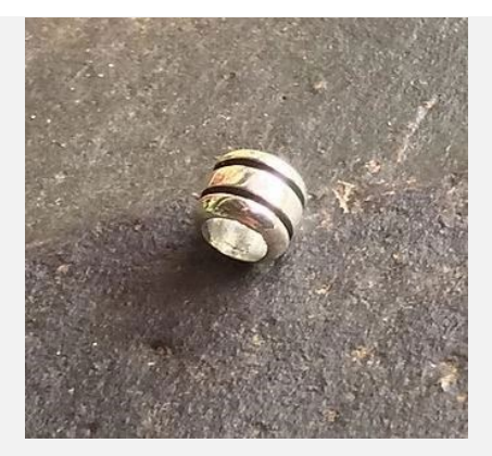
ROUND BEAD WITH STRIPES R90 ea.